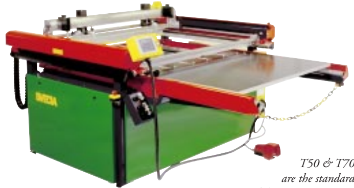
T50 & T70 are the standard versions of the new Sveciamatic generation - T-type.

The new (pat. pend.) squeegee carriage with level-searching squeegee pressure compensation improves print quality, as well as, reducing set-up time and work for the operator. With a new programmable vacuum/blow-back control system simplifying substrate feeding, the Sveciamatic T-type provides screen printers with all they need to achieve high performance and perfect results.